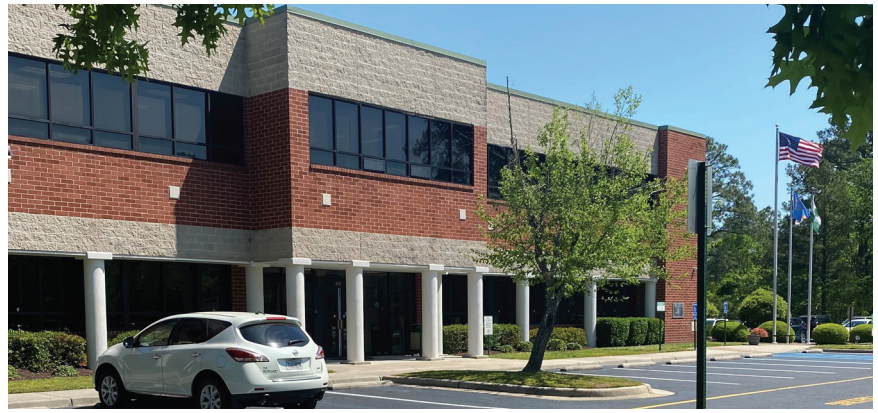
A Place for Girls, Council headquarters and regional program center in Chesapeake

Girl Scouts of the Colonial Coast (GSCCC) is one of 111 councils in the nation that is chartered by the Girl Scouts of the USA. We serve nearly 7,000 girls with the help of more than 4,000 adults in southeastern Virginia and northeastern North Carolina.